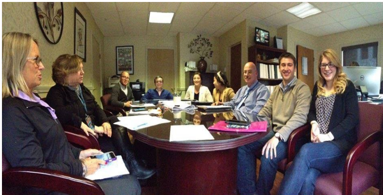
Steppingstone staff & Roger Williams University team hard at work.

ised to get back to us quickly with their proposed scope of work. Unfortunately, Mother Nature had other plans and the many February snow storms caused the project to slow to a